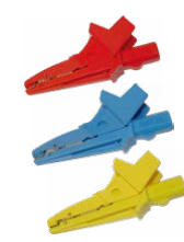
Crocodile clip 1 kV 20 A red / blue / yellow

WAPRZ1X2BLBB WAPRZ1X2REBB WAPRZ1X2BUBB WAPRZ1X2YEBB