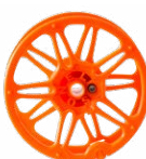
Test wire reel