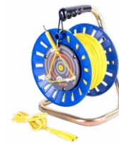
Test lead on a reel yellow 75 m / 100 m / 200 m

WAPRZ075BUBBSZ WAPRZ100BUBBSZ WAPRZ200BUBBSZ