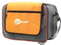
L-4 carrying case