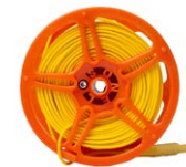
Test lead 40 m / 50 m / 60 m / 80 m (banana plugs, on a reel), yellow

WAPRZ040YEBBSZ WAPRZ050YEBBSZ WAPRZ060YEBBSZ WAPRZ080YEBBSZ