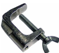
Cramp with banana socket