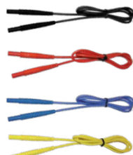
Test lead 1.2 m (banana plugs) black / red / blue / yellow

WASONBUOGB1 WASONREOGB1 WASONBLOGB1 WASONYE0GB1