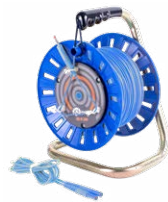
Test lead on a reel blue 75 m / 100 m / 200 m

WAPRZ075REBBSZ WAPRZ100REBBSZ WAPRZ200REBBSZ