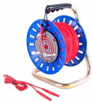
Test lead on a reel red 75 m / 100 m / 200 m

WAPRZ075REBBSZ WAPRZ100REBBSZ WAPRZ200REBBSZ