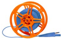
Test lead 15 m on a reel, banana plugs, blue