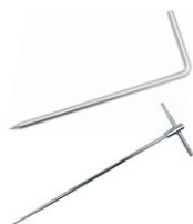
Earth contact test probe 25 cm / 80 cm