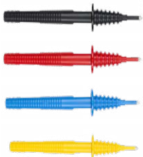
Pin probe 1 kV (banana socket) black / red / blue / yellow

WAPRZ040YEBBSZ WAPRZ050YEBBSZ WAPRZ060YEBBSZ WAPRZ080YEBBSZ